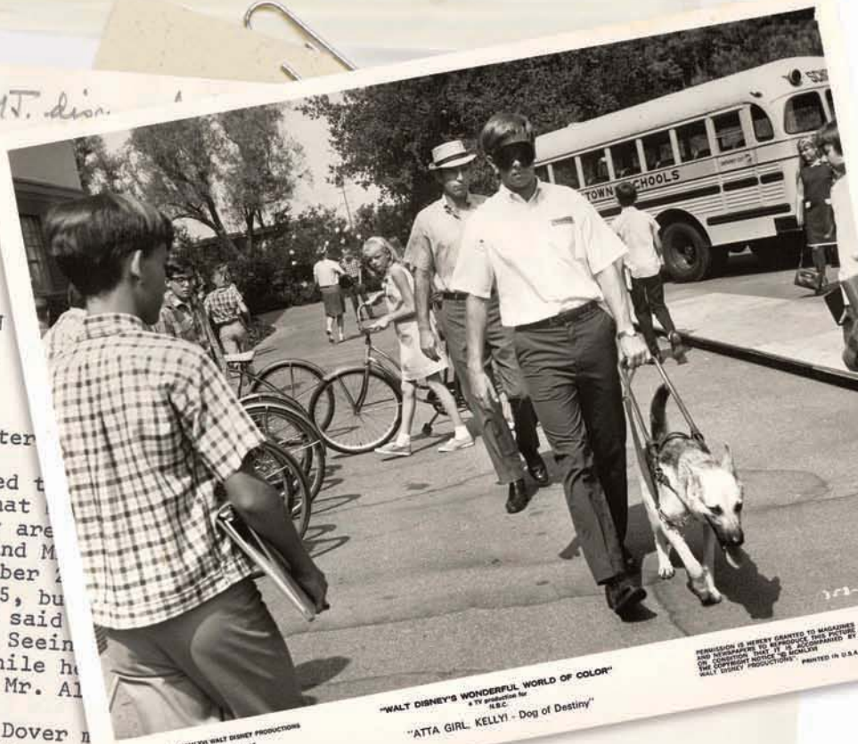
"WALT DISNEY'S WONDERFUL WORLD OF COLOR" a TV production for NBC "ATTA GIRL KELLY - Dog of Destiny"

PERMISSION IS HEREBY GRANTED TO MAGAZINES AND NEWSPAPERS TO REPRODUCE THIS PICTURE ON CONDITION THAT IT IS ACCOMPANIED BY THE COPYRIGHT NOTICE AS FOLLOWS WALT DISNEY PRODUCTIONS PRINTED IN U.S.A.