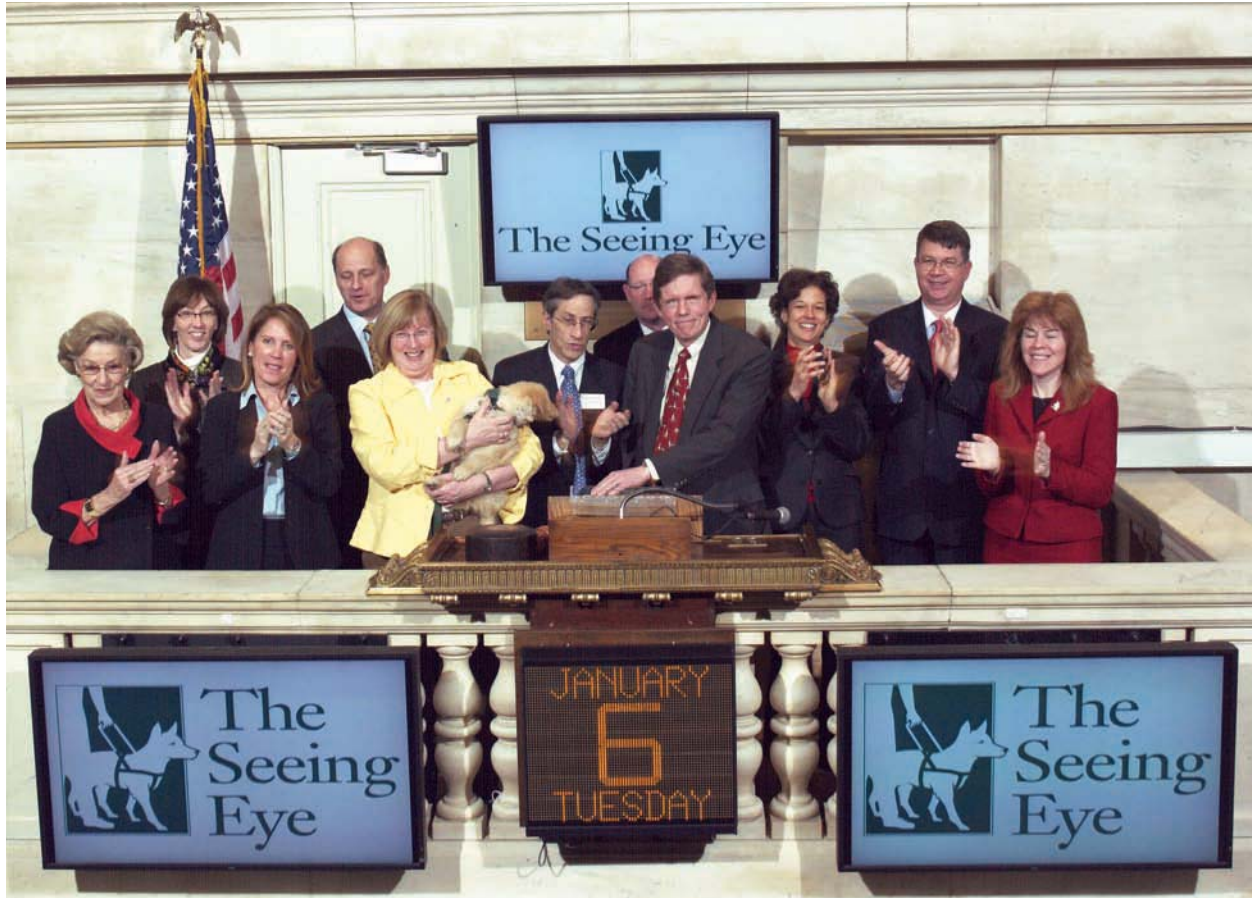
The Seeing Eye officially began its 80th anniversary celebration by ringing the opening bell at the New York Stock Exchange. For more information, see page 1.